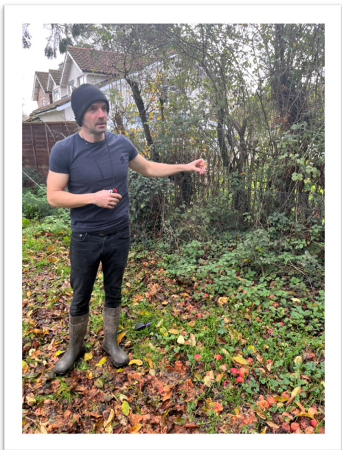
Left - Demonstrating the new garden nets provided by a DBWPS grant - difficult to see even for us!