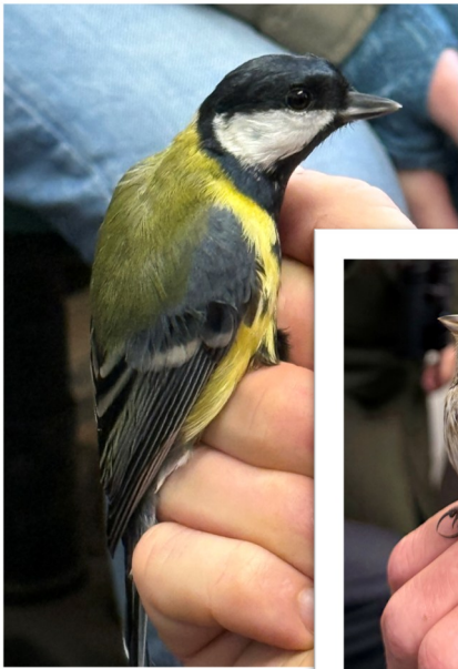
Great Tit and Reed Bunting

But first a couple of the earlier arrivals had had the rare delight of seeing an otter nearby the bridge. We all enthusiastically checked out the water either side of the bridge but no further otter sightings were made. We were compensated by good bird numbers though. A selection of what we saw here were: Great Crested Grebes, Great Egrets and Little Egrets stalking and feeding alongside each other; a raft of gulls included some Common Gulls. Oh, and so many Northern Shoveler I lost count, Tufted Duck and a real treat of 4 Whooper Swans. A few of us had failed to bring warm gloves, hats and scarves so were caught off-guard by the first really chilly morning and decided to make our way to the warmth of the ringing station.